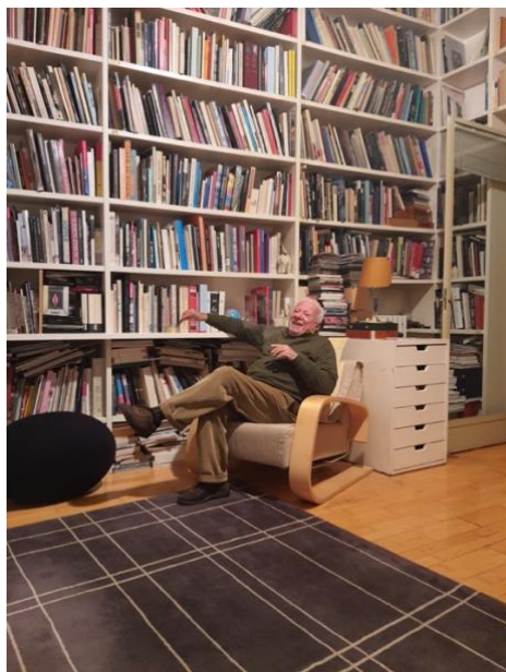
Achille Bonito Oliva in his studio in Rome, 2021